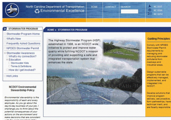
DOT's Public Education Website (above) Examples of stormwater brochures distributed to the public (above right)